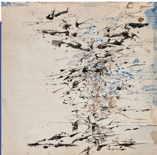
ZAO WOU-KI Untitled - circa 1958 Ink and watercolour on paper Estimate : €20,000 - 30,000

- Hugues Sebilleau, Post-War and Contemporary Art Director, Artcurial